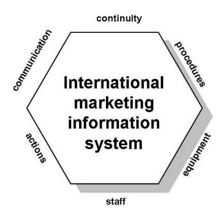
Figure 1 The international marketing information system

Viewed like this, the international marketing information system has taken over the role of corporate information systems, and also represents a continuous work in the process of in-house and external communication. The functioning of the international marketing information system provides a company with continuous information required for high-quality marketing decision-making. The international marketing information system can be graphically represented as follows: